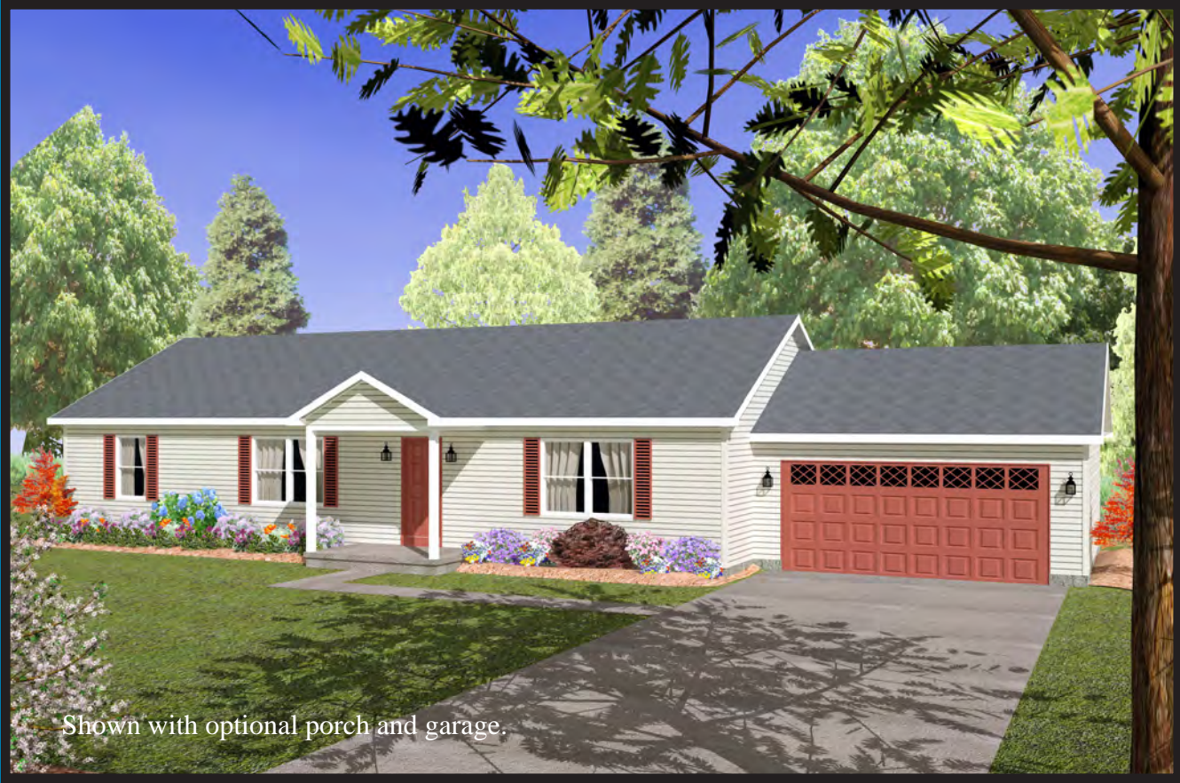
Shown with optional porch and garage.