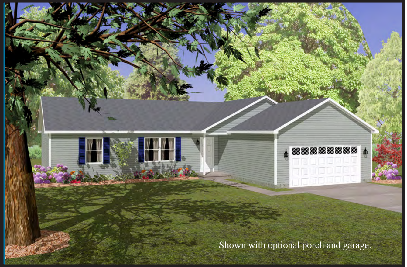
Shown with optional porch and garage.