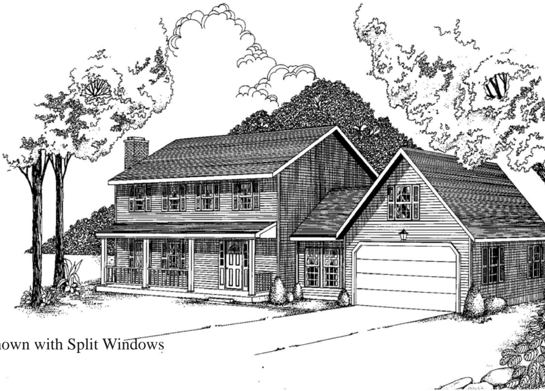
Shown with Split Windows