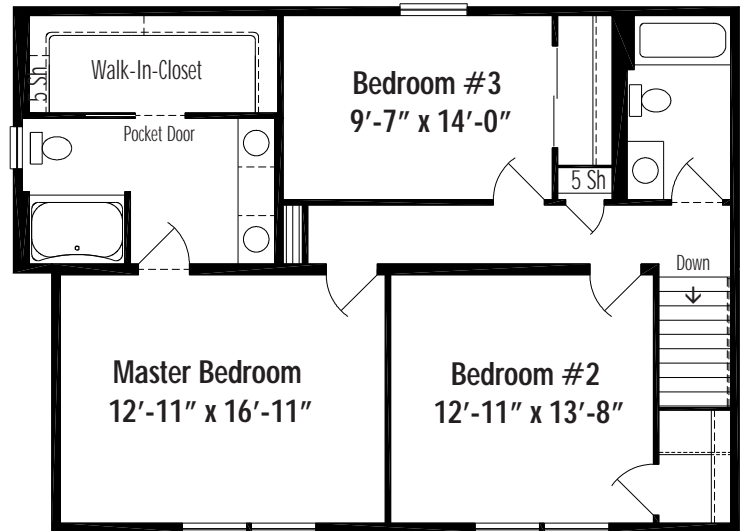
Williamsburg B Crawl Space 27'-4" x 36/38', Total Living Area 1998 Sq. Ft.